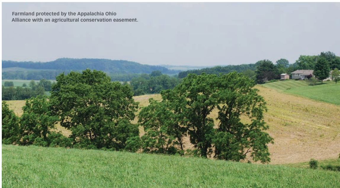
Farmland protected by the Appalachia Ohio Alliance with an agricultural conservation easement.

THE DETAILED TERMS AND CONDITIONS AND COMMITMENT LETTER, PLUS ADDITIONAL BACKGROUND INFORMATION ARE AVAILABLE AT WWW.LTA.ORG/CDINSURANCE . PLEASE CALL LESLIE RATLEY-BEACH WITH ANY QUESTIONS AT 802-262-6051 OR WRITE TO LRBEACH@LTA.ORG .