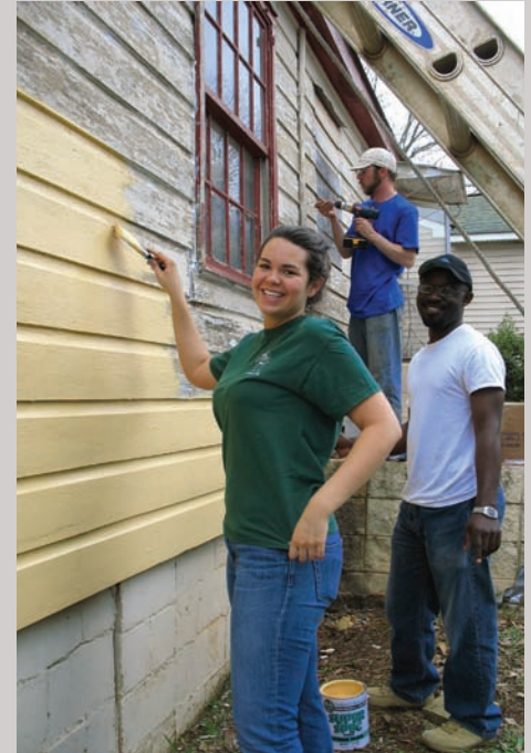
ATHENS LAND TRUST

The land trust applied for accreditation in 2008 after completing Assessing Your Orga-